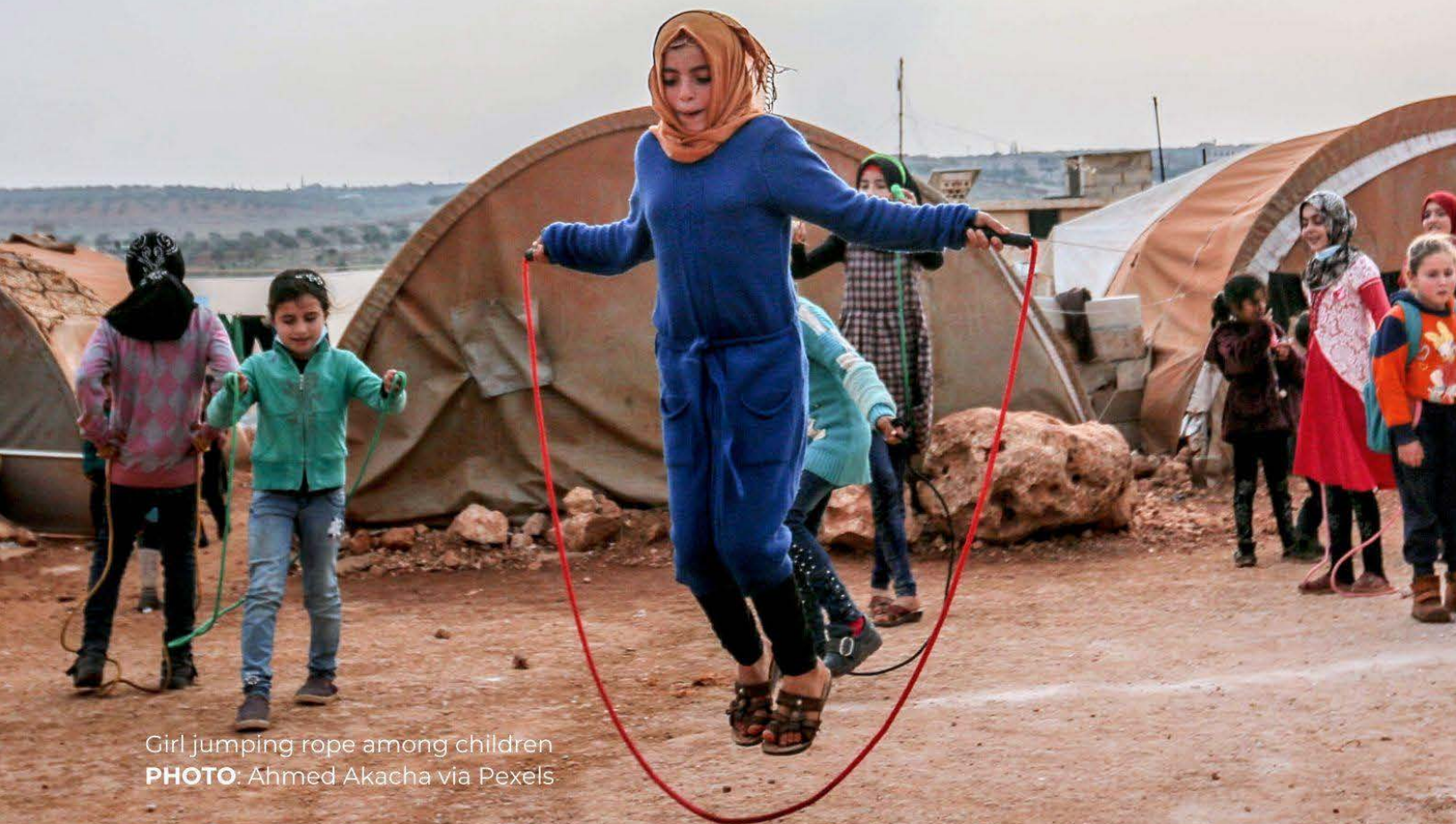
Girl jumping rope among children