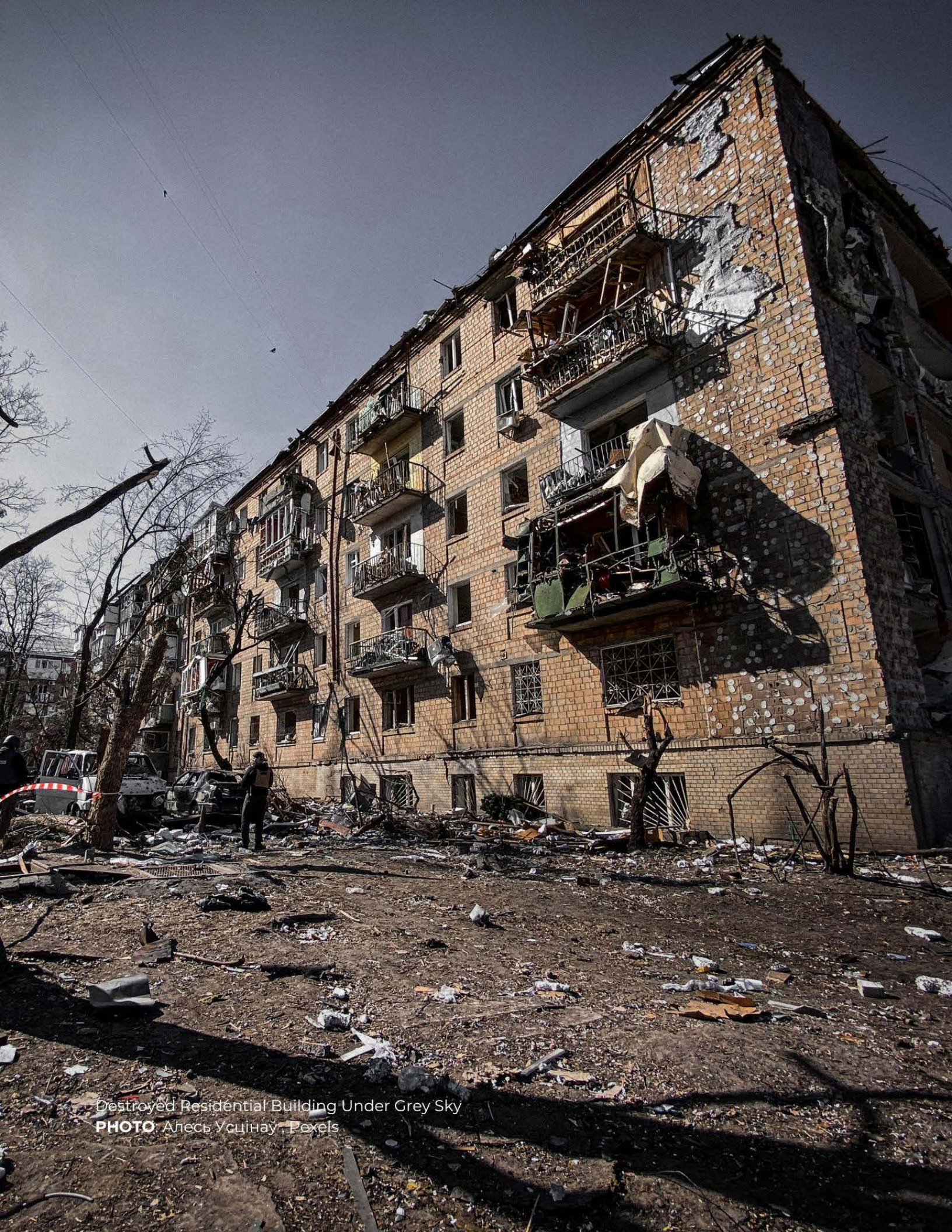
Destroyed Residential Building Under Grey Sky